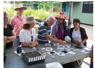
Photo: Collecting seeds for the seed bank.