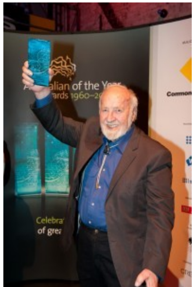
Photo: Bill celebrates his nomination in Hobart. Image courtesy of the National Australia Day Council

Whilst unsuccessful in winning the national title he is extremely pleased with being recognised for all his efforts here in Tasmania.